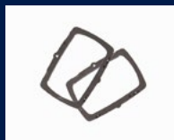
Gel Holders LL LS2603