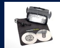
Gobo LL LS2625