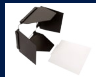
Barn Doors LL LS2620