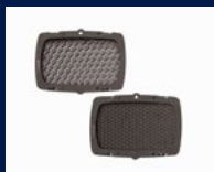
Honeycomb Set LL LS2602