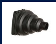
Snoot LL LS2619