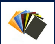
Gel Set LL LS2604