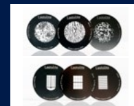
Nature / Architectural LL LS2613 LL LS2612